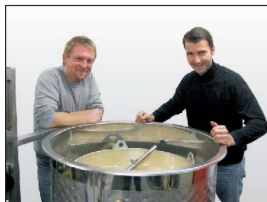
„Brewing makes fun“