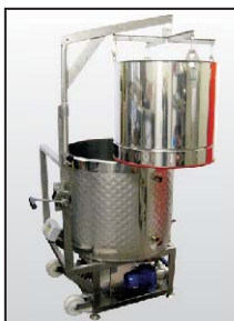
Well thought-out function