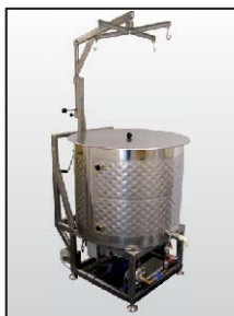
Compact and mobile facility