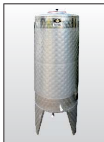
Accessory: fermentation barrel 240 l